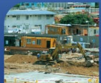
Construction Site Management