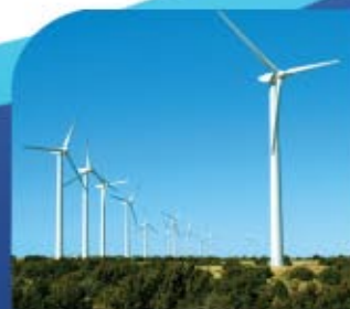
Unmanned Site Management