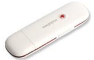
Mobile Data Modem