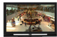
16:9 Wide Screen

With a resolution over 800TVL, it provides ultra-high resolution video quality and more detail for identification. By employing progressive scanning, TeleEye MX Series HD CCTV is also able to create images with least distortion and jaggedness.