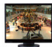
4:3 Standard Resolution