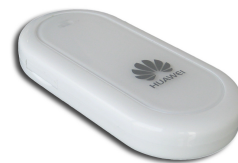
Mobile Data Modem